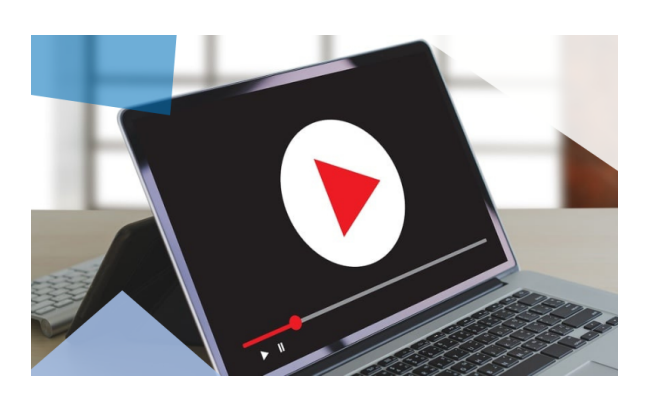
From Transaction to Interaction: Leveling Up the Member Experience

Thanks to technology, video editing platforms have been created to help your institution not only be trendy but enable you to meet your members how and when they want.